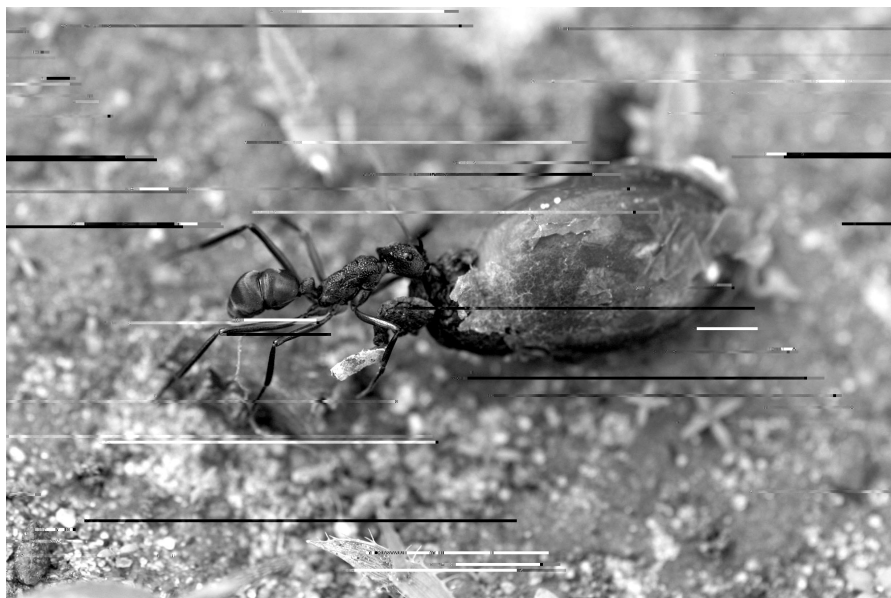
PLATE 1. A Rhytidoponera aurata worker transporting an Acacia dunnii seed in tropical savanna woodland outside Darwin, northern Australia. The worker is dragging the seed by the elaiosome. This is a large ant (8 mm length) and a large seed (12 mm length, 302 mg).

seeds in habitats dominated by the invasive Argentine ant, Linepithema humile , rarely escape the parental canopy and remain vulnerable to small-mammal predators (Bond and Slingsby 1984). Perhaps as a result, seedlings in invaded habitats are poorly dispersed and less than 1/10 as abundant (Bond and Slingsby 1984), in some cases even leading to local extinctions of plant species (Christian 2001). Why these problems occur, and whether we might expect similar disruption of this ant-plant mutualism after invasions by other exotic ants, is not yet well understood.