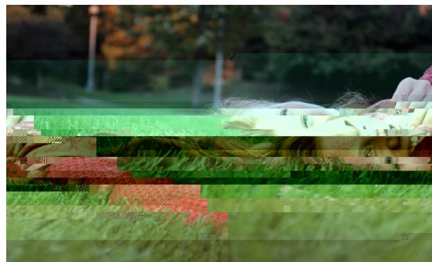
"Girl on the Green, Fall"